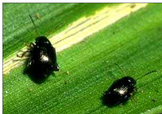
less than 3 mm in diameter giving the leaves a characteristic 'shot hole' appearance.

The larvae are root feeders. They trim the root hairs and make circular pits in taproots. The adults feed on the leaves and stems of emerging seedlings. They chew small holes or pits, usually